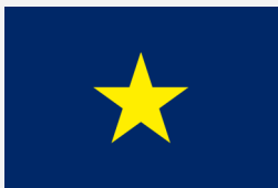
National Standard or Burnet Flag

Many of you know that six different national flags have flown over Texas and we proudly wave those flags for public display. Rarely mentioned was a seventh flag that flew over the Republic of Texas for three years beginning in 1836. The flag was known as the National Standard of Texas or the Burnet flag and symbolized independence. It consisted of one Gold star on a blue field. When Texas became a state on Dec 29, 1845, the national flag, adopted on January 25, 1839, changed to the familiar red, white and blue fields with a white star – the Lone Star flag remains today and its colors represent bravery, purity and loyalty. Wikipedia